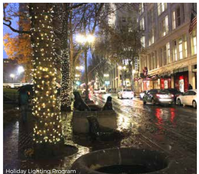
Holiday Lighting Program