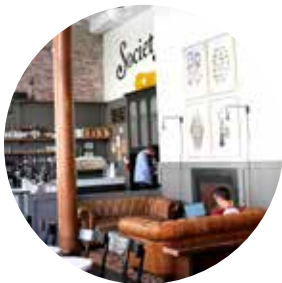
The Society Hotel

In 2012, Portland enacted a Tourism Improvement District (TID), a hotelier-recommended assessment of 2 percent per night is placed on guest room revenues for all city of Portland hotels with more than 50 rooms. The TID provides a stable source of tourism funding to support sales, marketing and promotional efforts, including targeted advertising to promote Portland's tax-free shopping status.